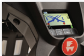
Programmable Load Height Adjusts to match your ambulance floor height.

Continuous and Flashing modes both allow you to see and be seen in dark and hazardous conditions.