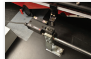
Integrated Charging System (ICS) Eliminate battery management.

Listening to and working together with medics, we built the ONLY integrated patient transport and loading system PROVEN TO EFFECTIVELY ELIMINATE LIFTING. Now you can keep your focus right where you want it to be: SAVING LIVES.