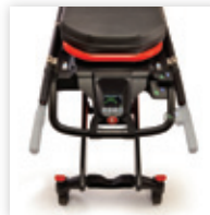
Telescoping Foot-End Handles Increase patient foot clearance during operation.