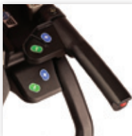
Simple One-Touch Operation Helps you stay focused on patient care.