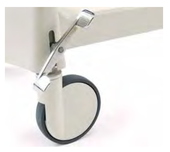
Four 8" Swivel Wheels lock instantly with a single foot pedal or one set of wheels directionally locks for easy rolling.