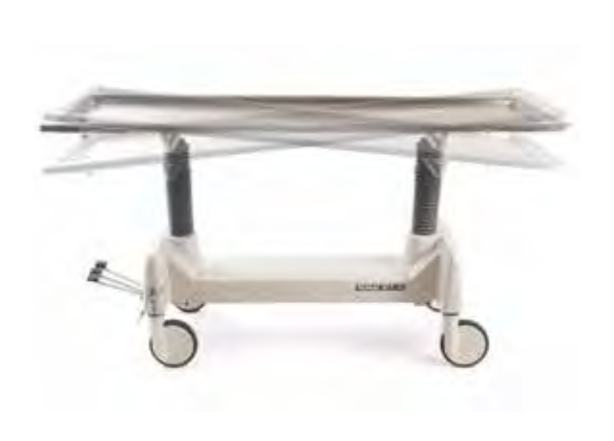
Multiple Positions at either end from 28½" to 40½" above the floor for easy preparation from a standing or sitting position.