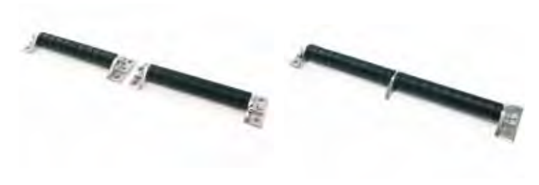
Single Roller Assembly