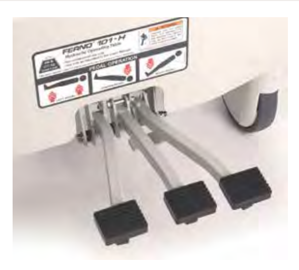
Three Foot Pedals provide quick height and angle adjustments.