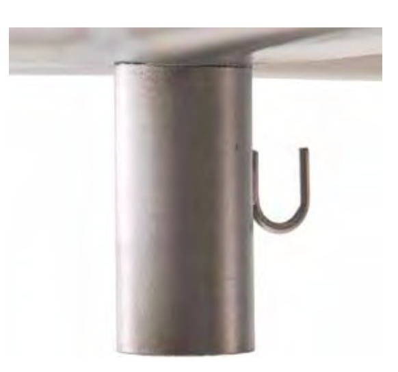
Drain in the center of the foot end quickly eliminates fluids from the table.