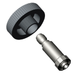
SCBA-DIN Adapter (European Standard) Part #: 9131-S